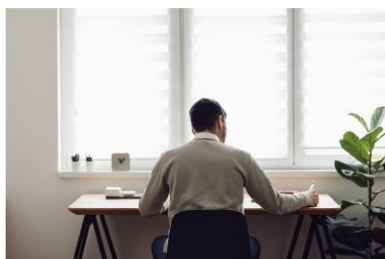
Mobile device placed behind you