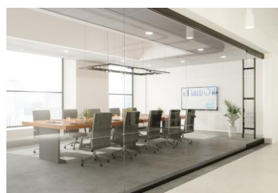
Room with glass walls