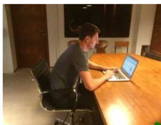
Correct frame for the mobile device