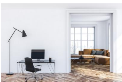
Room with opening to other room / room without door