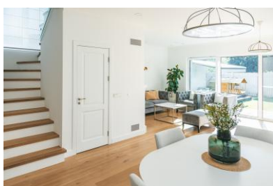
Room with more than one access point (door, French window, interior stairs without a door)