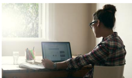
Mobile device placed sideways/at an angle