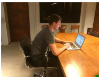
Correct frame for the mobile device