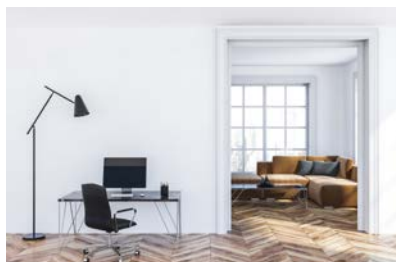
Room with opening to other room / room without door