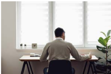
Mobile device placed behind you