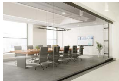
Room with glass walls