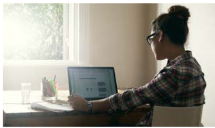
Mobile device placed sideways/at an angle