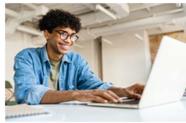
Mobile device placed too close and not laterally