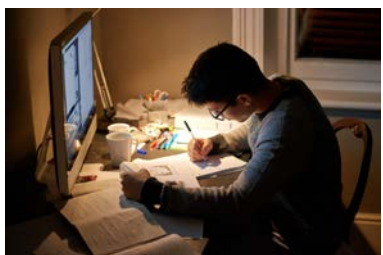
Dark room and non-authorized objects