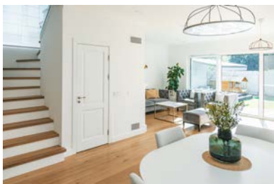
Room with more than one access point (door, French window, interior stairs without a door)